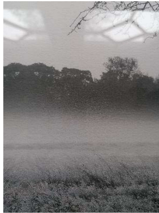
Invisible Trees 1