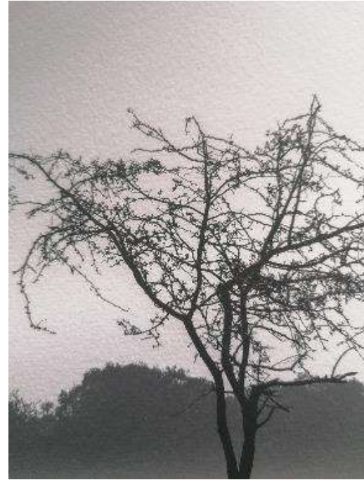
Invisible Trees 1