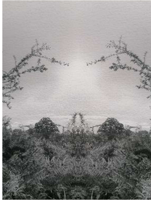
Invisible Trees 2