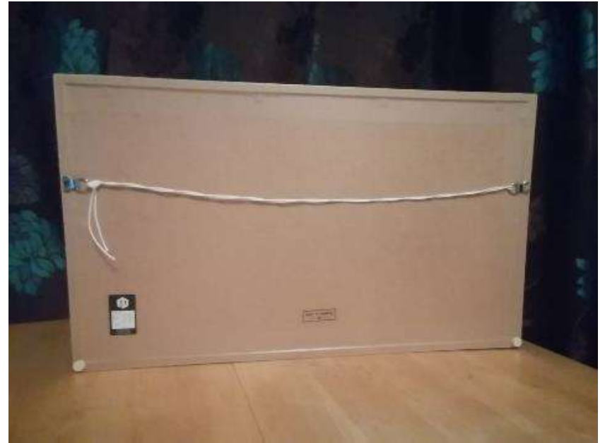
Invisible Trees 1

24" x 12" print size – float mount – 2" border – 0.8" frame width – 29.2" x 17.2" total size