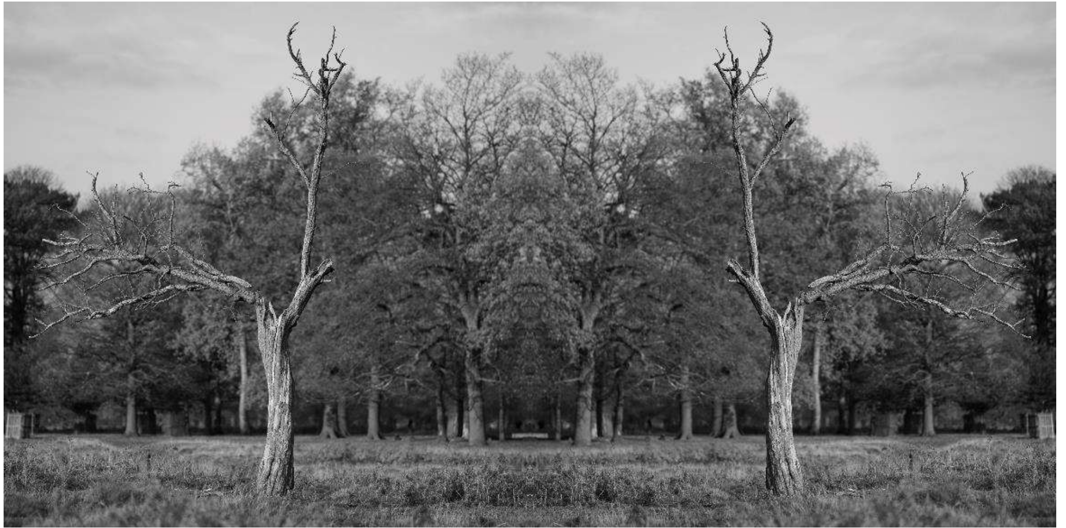
Invisible Trees 3