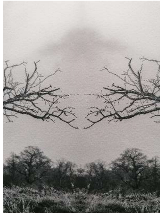
Invisible Trees 4