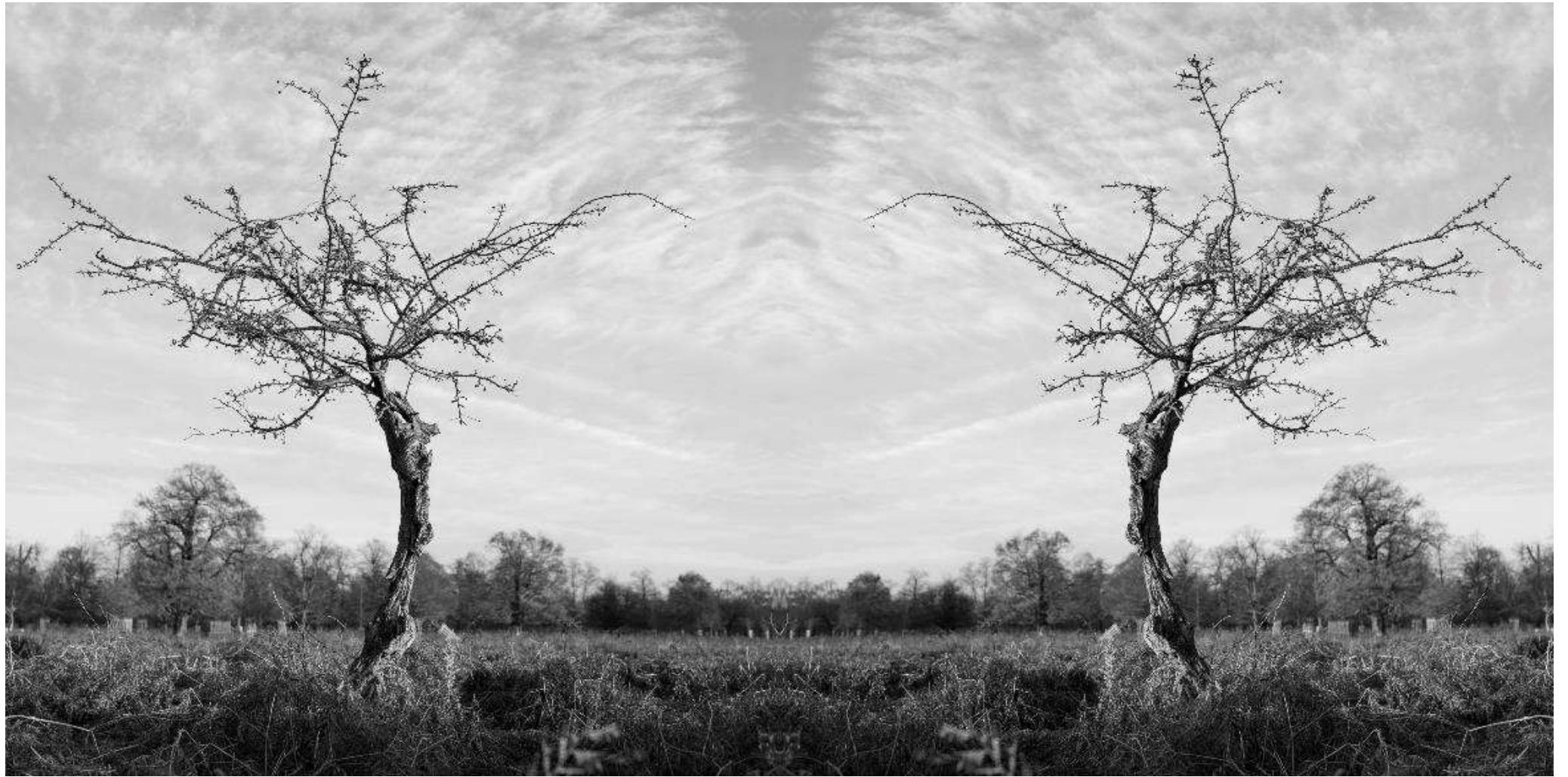
Invisible Trees 6