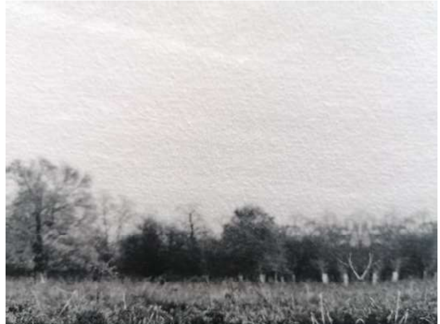
Invisible Trees 6