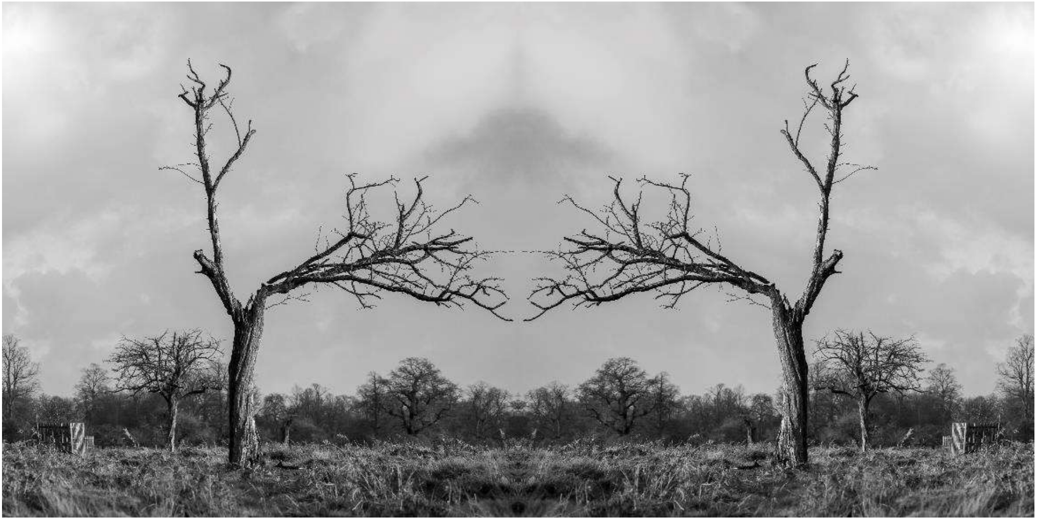
Invisible Trees 4