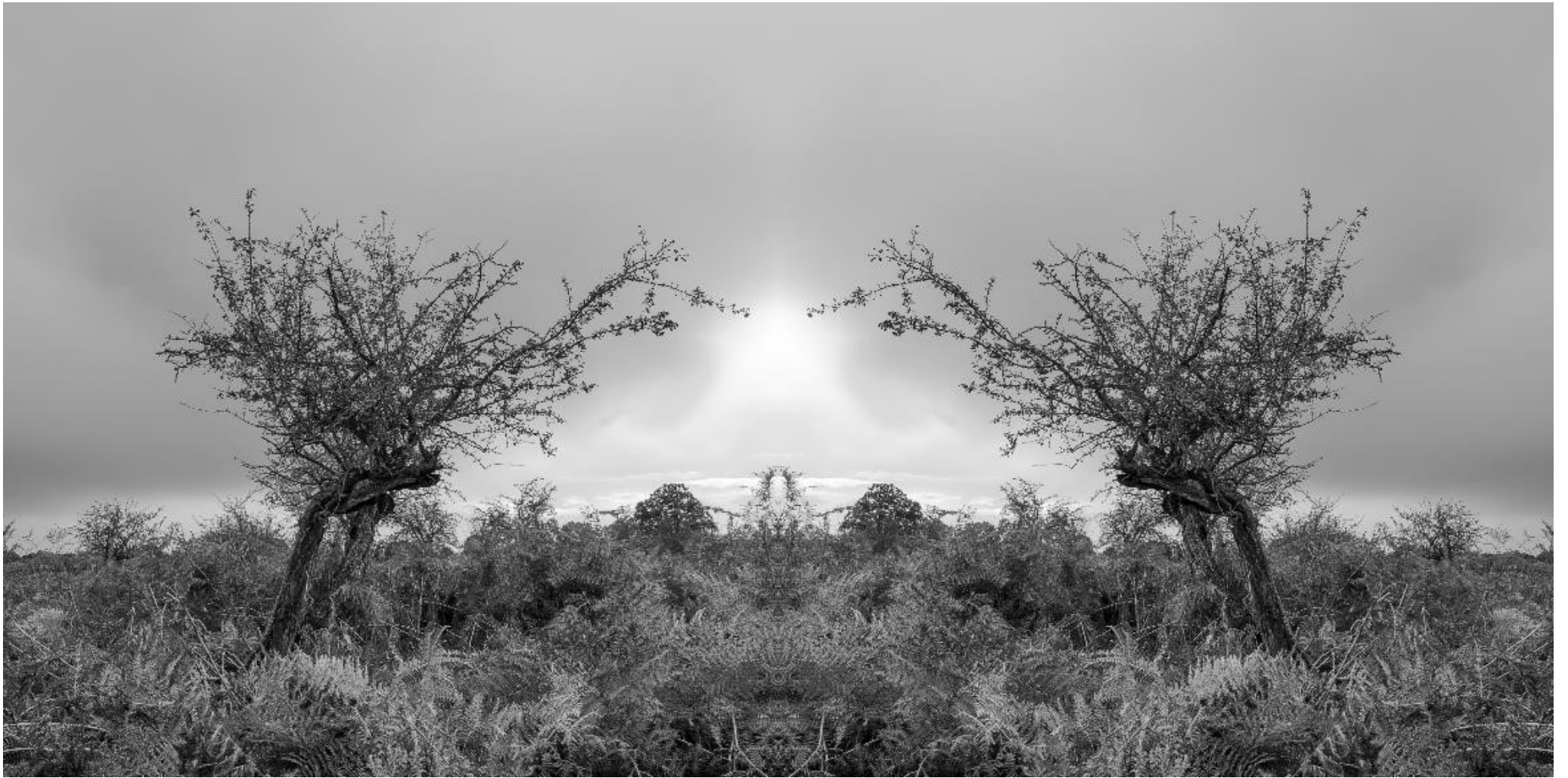
Invisible Trees 2