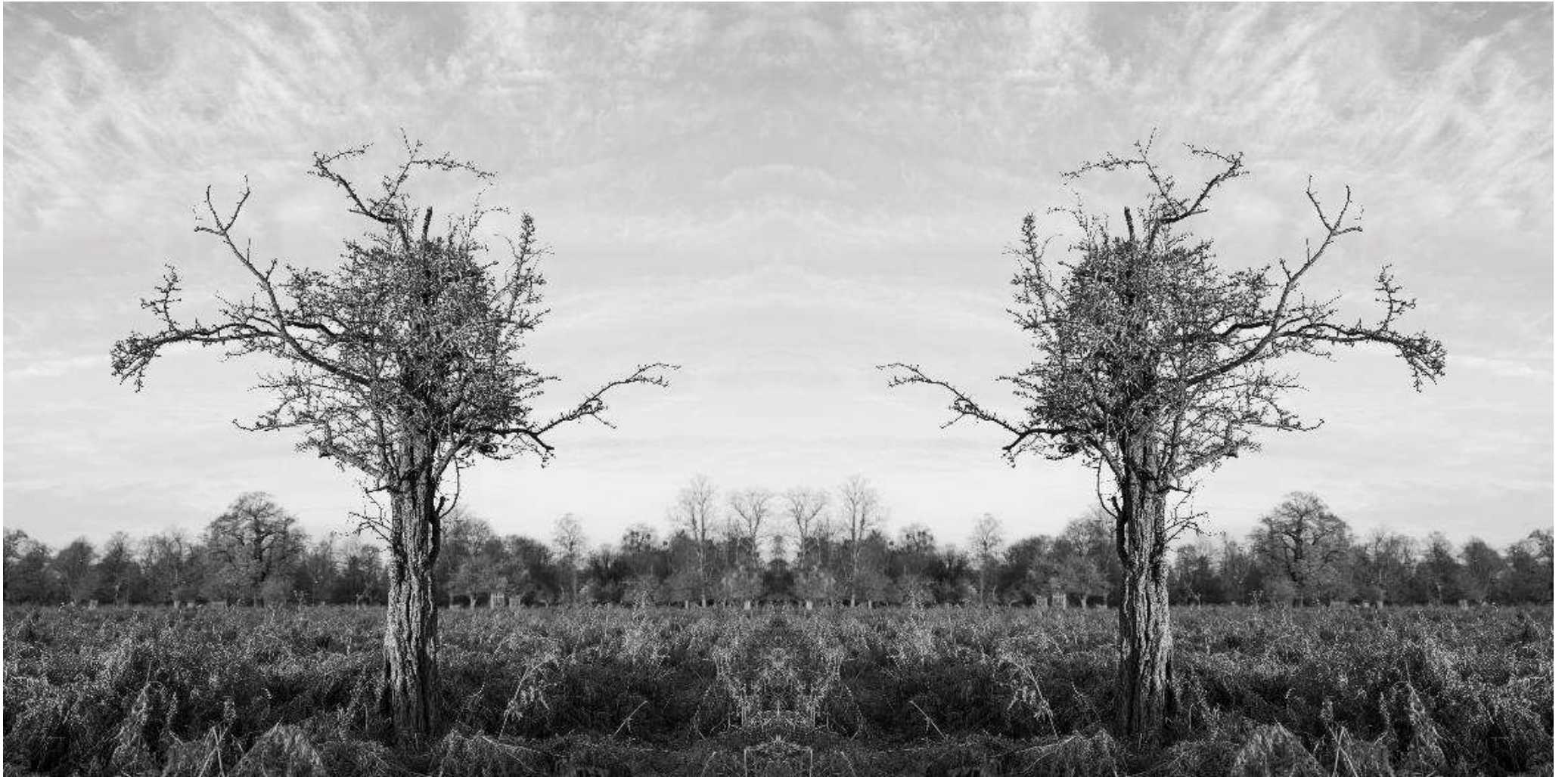
Invisible Trees 5