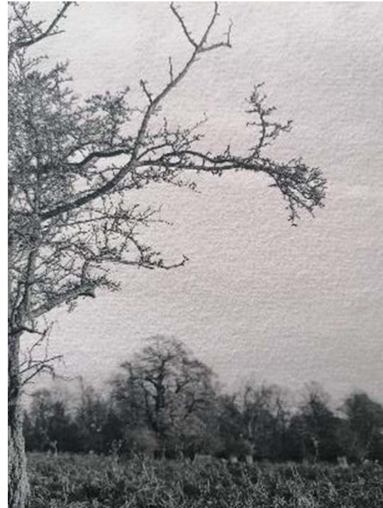
Invisible Trees 5