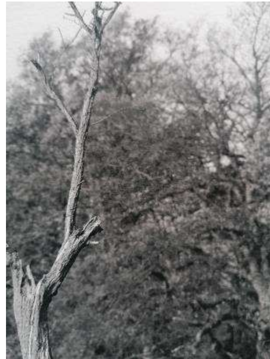
Invisible Trees 3