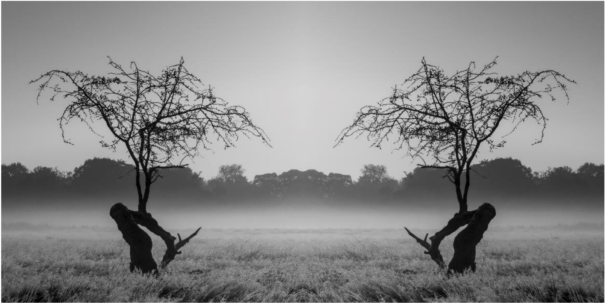
Invisible Trees 1